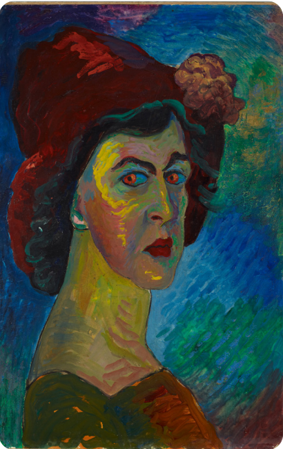
Self-portrait I by Marianne von Werefkin, 1910

Expressionism was a significant art movement that began in Germany around 1905. Artists, called Expressionists, sought to express the mood, feelings and emotions of themselves or their subjects in their artwork rather than showing people, events or objects realistically.