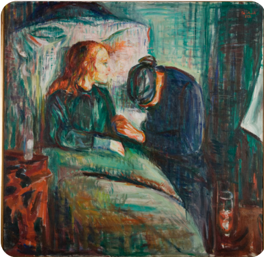
The Sick Child by Edvard Munch, 1896

Expressionist artists apply colour generously using free brushstrokes, as seen in Walter Gramatté’s portrait. This means they create texture and use brushstrokes on the canvas that they have not planned but done spontaneously for effect.