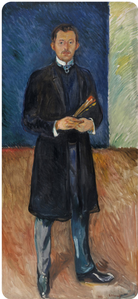
Self-portrait with Brushes by Edvard Munch, 1904

Edvard Munch was an Expressionist painter. He was Norwegian. He was born in 1863 and he died in 1944. Many artists regard him as the Father of Expressionism. He produced many paintings in his lifetime, but The Scream has become an iconic image in the art world.