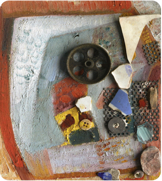
Merz Picture with Porcelain Fragments by Kurt Schwitters, 1945–1947

The German artist, Kurt Schwitters, lived from 1887–1948 and is famous for his mixed media collages called ‘Merz pictures’. Artists who create mixed media collages use different joining methods, including gluing, stitching and tying.