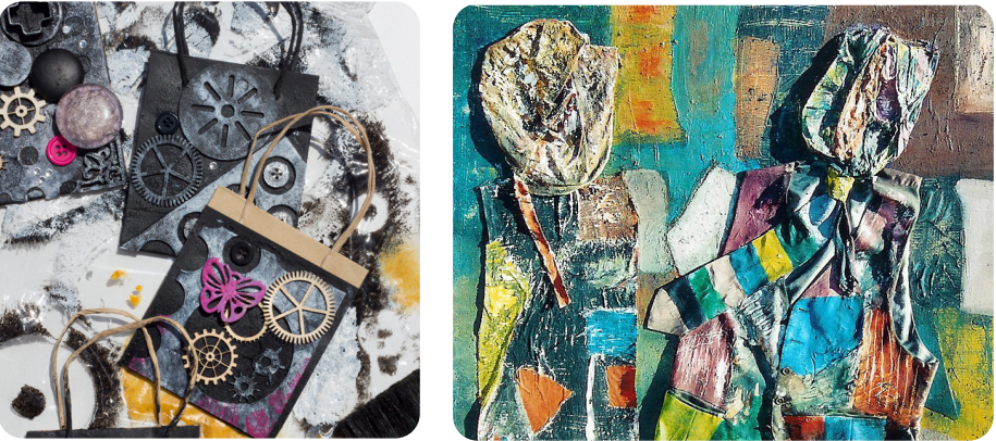
mixed media collages

The term ‘mixed media’ describes artwork that uses more than one medium, such as paper, fabric, photographs and 3-D objects, like buttons. Collage is a type of mixed media art.