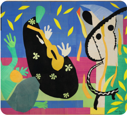
Sorrow of the King by Henri Matisse, 1952

Paper collages are made by gluing different types of paper to a background. The paper used to make a collage can be torn, folded, crumpled or layered to create interesting textural effects. Henri Matisse is well known for his collage art.