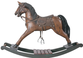
wooden rocking horse