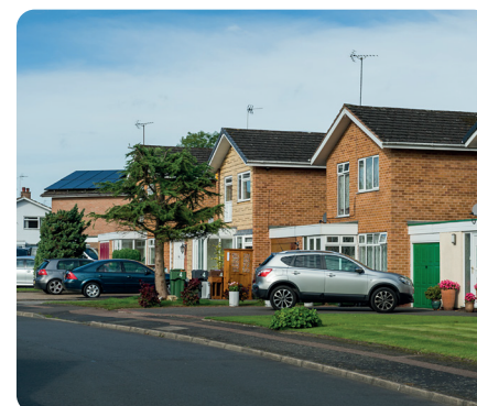
A street today.