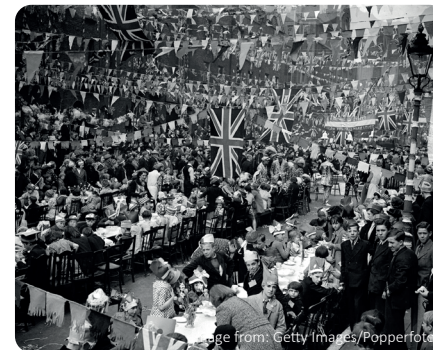
Street party to celebrate the coronation.