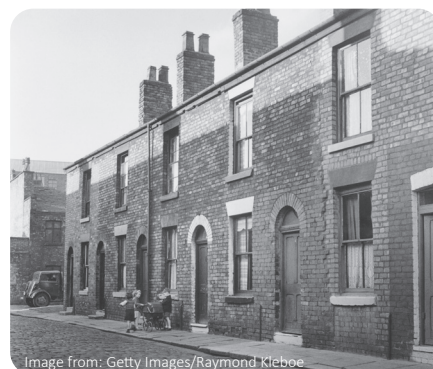
A street in the 1950s.

The way people use land changes over time. For example, in the 1950s there were fewer cars, so fewer roads were needed. Today lots of people have cars, so there are many more roads for people to drive on and driveways for parking.