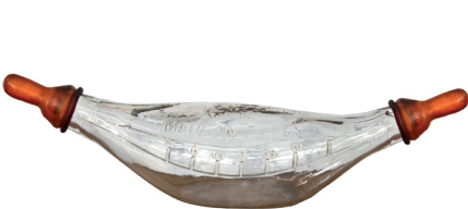
Victorian baby bottle

An artefact is an object from the past. Museums often display historical artefacts. Artefacts can tell us about how people used to live. Everyday objects like baby bottles, clothing, toys and books can tell us about childhood in the past.