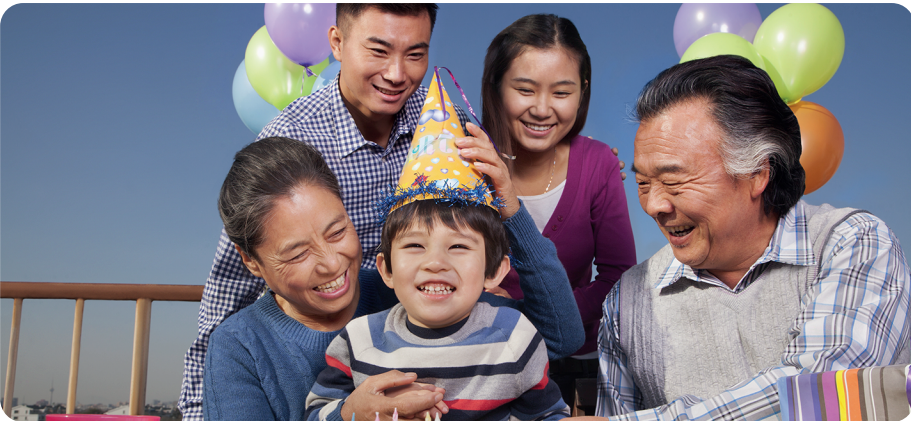
Birthdays happen every year.

Important life events include birthdays, religious festivals or family celebrations. Some life events happen every year and some happen at certain stages of human life.