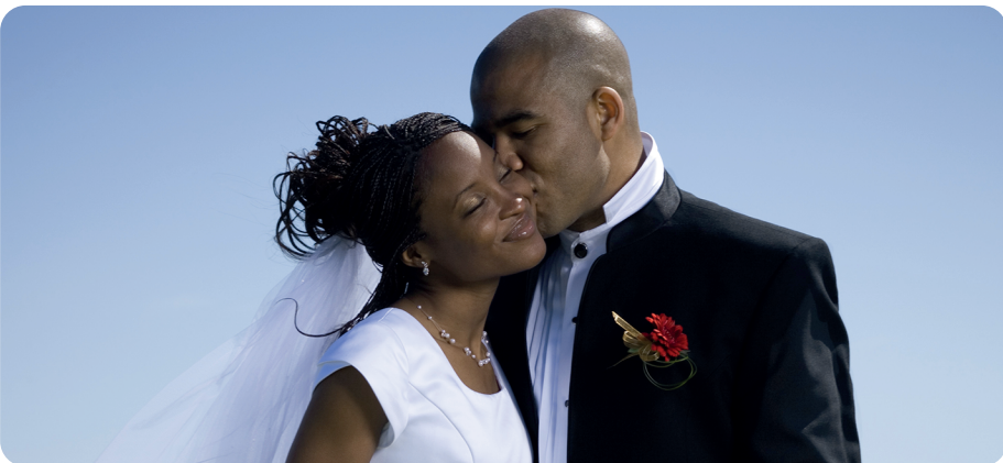
Weddings happen when two adults get married.