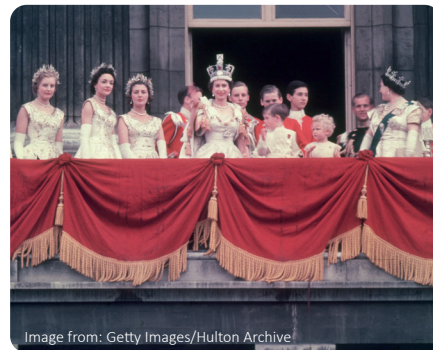
Queen Elizabeth II on her coronation.

A coronation is a ceremony where the crown is placed on the head of the new king or queen. Elizabeth II was the Queen of the United Kingdom for 70 years until she died in 2022. The coronation ceremony of Elizabeth II took place on 2nd June 1953 at Westminster Abbey, London. Many people celebrated the coronation by holding street parties.