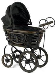
wood and metal pram