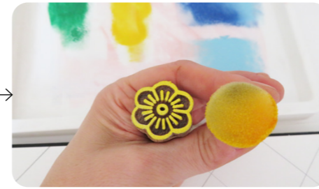
Cover the printing block with ink using a sponge or brush.