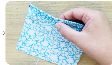
Use a needle and thread to sew running stitches along the hem.