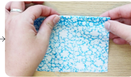
Turn the edge of the fabric over to make a 1.5cm hem. Pin it in place.