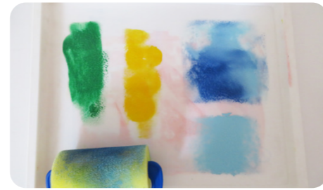
Use a roller to spread ink onto a printing tray.

Block printing uses a block with a pattern or motif carved into its surface. Ink or dye is applied to the carved surface, which is pressed onto fabric or paper repeatedly to make a pattern.