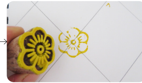
Press the block onto a piece of paper or fabric.