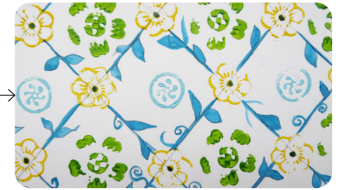
Repeat with other blocks and colours until the pattern is complete.