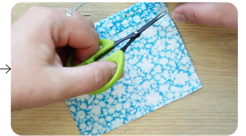
Tie a knot at the end of the hem and cut the thread. Iron along the crease to flatten the hem.