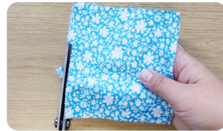
Trim the edge of the fabric with pinking shears.

A hem runs along the edge of a piece of cloth or clothing. It is made by turning under a raw edge and then sewing to give a neat finish to the fabric and to stop it from fraying.