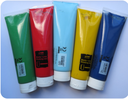
coloured printing inks