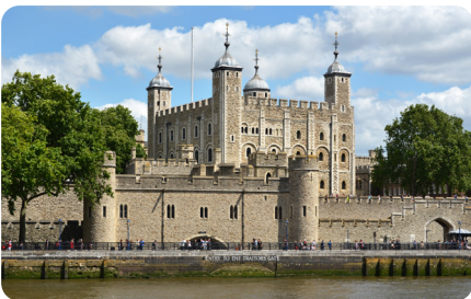
Tower of London