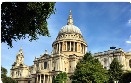
St Paul's Cathedral