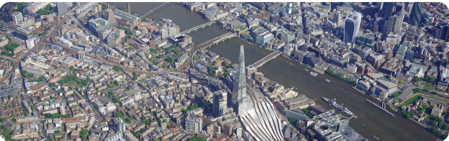
Aerial view of London

A city is a large, busy settlement where lots of people live and work. A city usually has a cathedral, a river, important buildings and offices where people work. There are lots of things to see and do in a city. There are many shops and restaurants to visit.