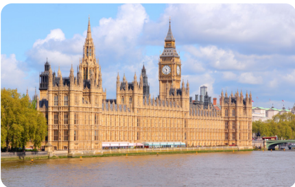
Houses of Parliament

London is a city. It is the largest settlement in the United Kingdom. Over eight million people live there. The River Thames is the main river that runs through the city. Tourists visit London to shop and see its famous landmarks.