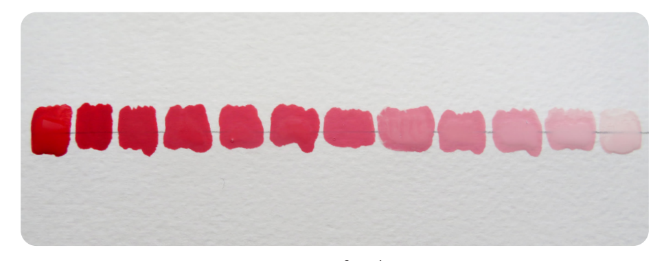
tints of red

A tint is a colour mixed with white. The more white paint that is added to the original colour, the lighter the tint. A tint can range from slightly lighter than the original colour, to almost white. When mixing a tint, begin with the pure colour and add white paint a tiny bit at a time.