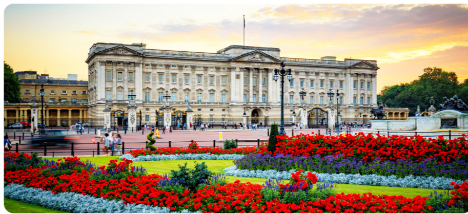
Buckingham Palace is in London, England.

Royal residences include palaces, castles and stately homes. Some of them are used for official royal business. Some are used as holiday or private homes. Many are tourist attractions.