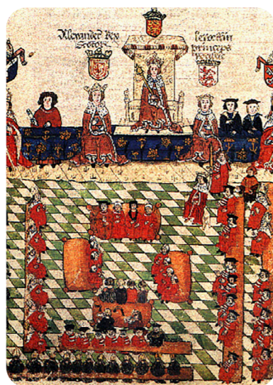
Edward I and the Model Parliament

The power of the monarchy has changed over time. In the past, some monarchs had absolute power. This meant that they could do whatever they wanted. Today, there is a constitutional monarchy. This means that the monarch is controlled by parliament and the government.