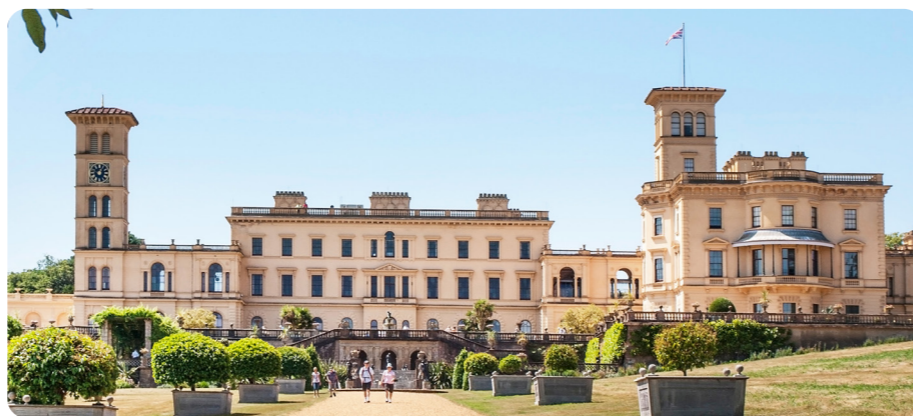
Osborne House is on the Isle of Wight, England.