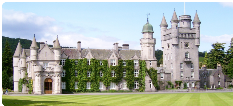
Balmoral Castle is in Aberdeenshire, Scotland.